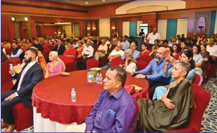
A section of the audience