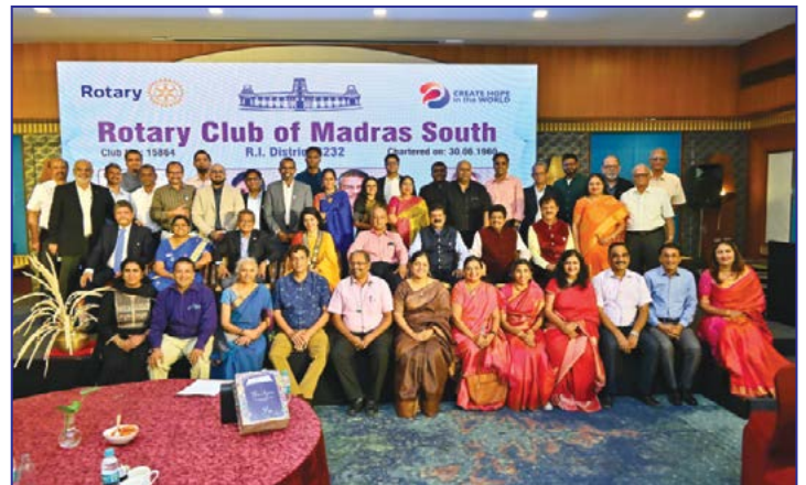
Southerners at the installation