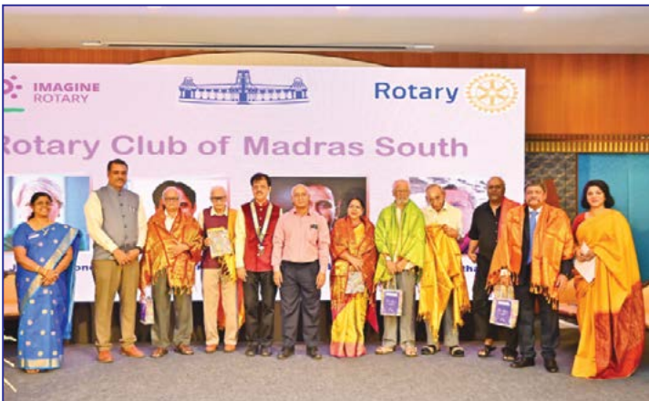
Senior Rotarians being honoured