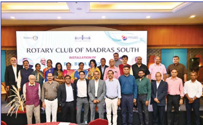
RCMS Board members for 2023-24