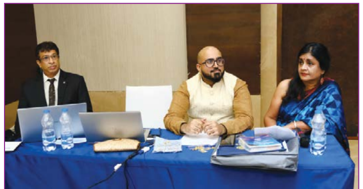
The MCs for the evening in action

With Best Compliments From A WELL WISHER