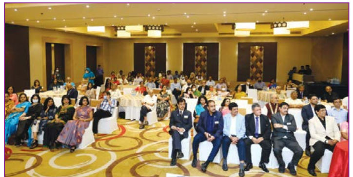
The audience in rapt attention