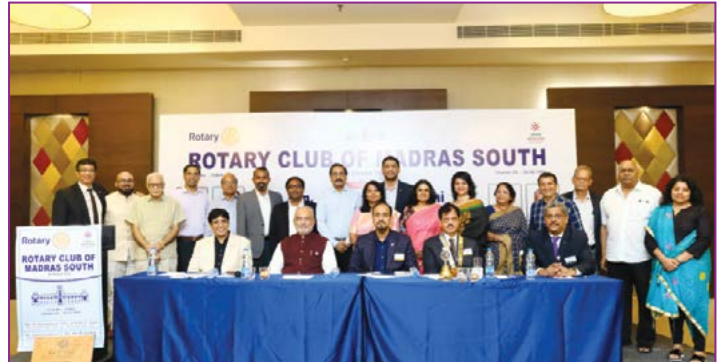
Board members for RY 22-23