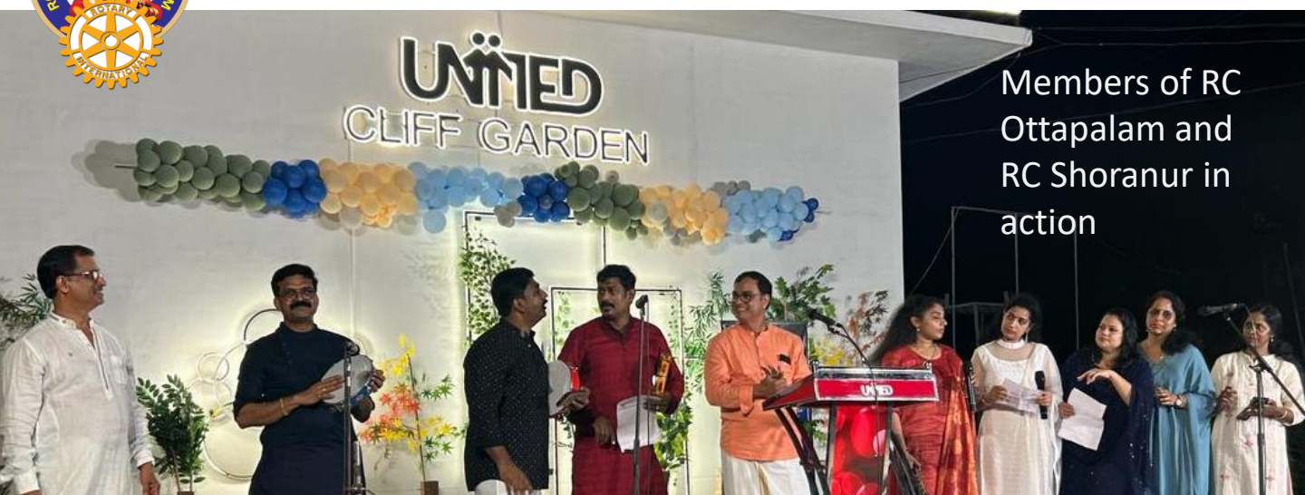
Members of RC Ottapalam and RC Shoranur in action