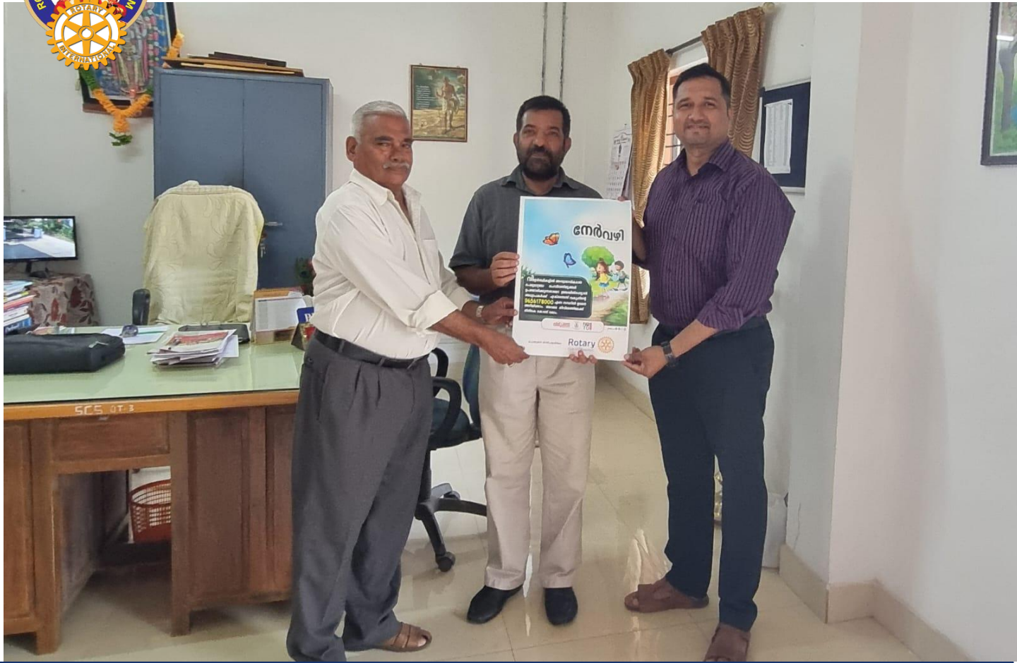
Above: Distributed Anti Drug Abuse posters to Swathy Central School, Vaniyamkulam on 20-Mar-2024