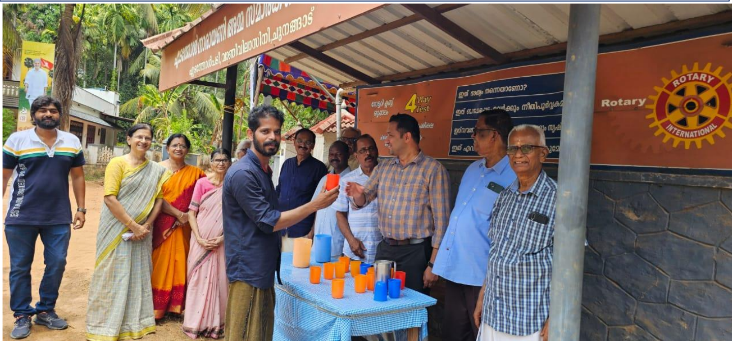
Below: Rotary club distributed buttermilk to public on pooram day at Chathankandar kavu sponsored by Rtn Prabhurajan on 4-4-2024