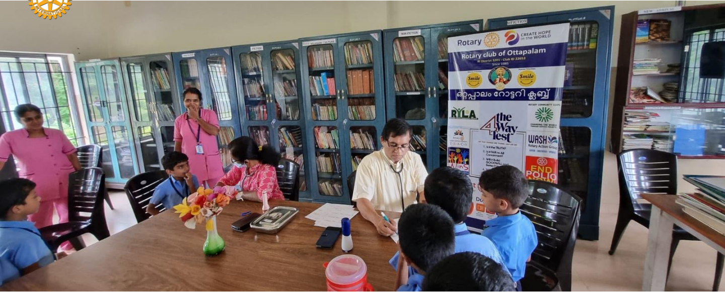
Conducted a health checkup for students of Bhavans Vidyalaya, Ottapalam on 14-9-23