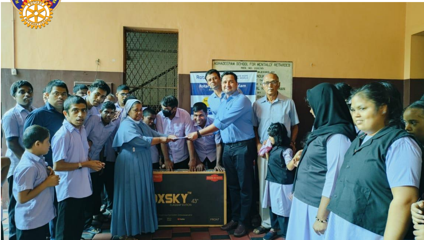
20231030-Donated a 43 inch Smart TV to the specially abled children of Ashadeepam School Koonathara