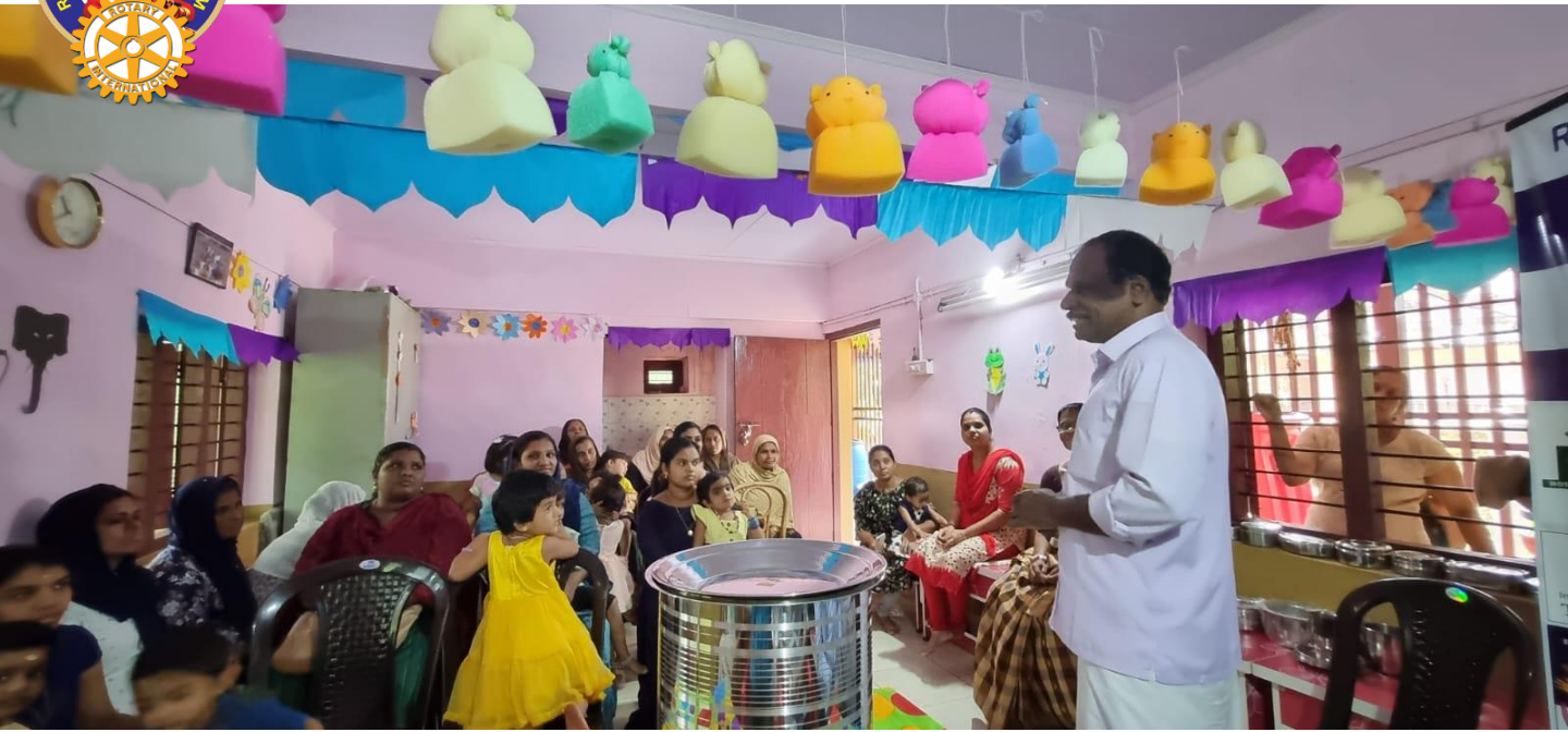
20231031 Donation of Utensils to Vanivilasini Anganwad (above and below)