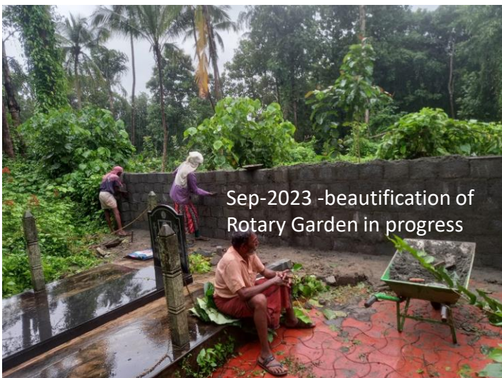
Sep-2023 -beautification of Rotary Garden in progress