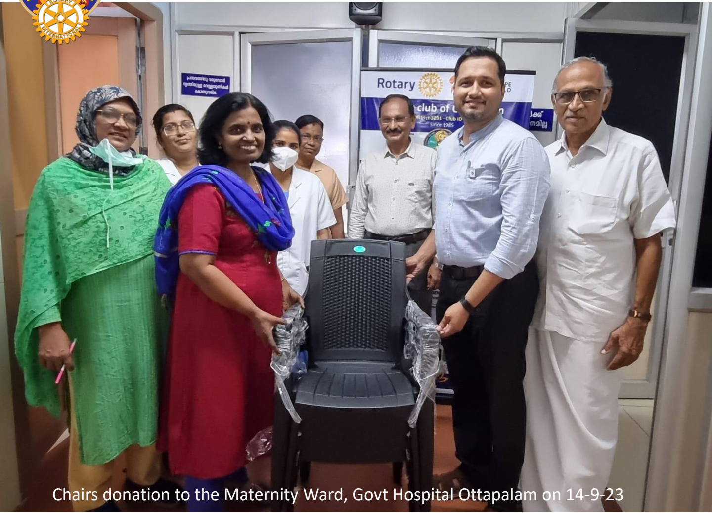
Chairs donation to the Maternity Ward, Govt Hospital Ottapalam on 14-9-23