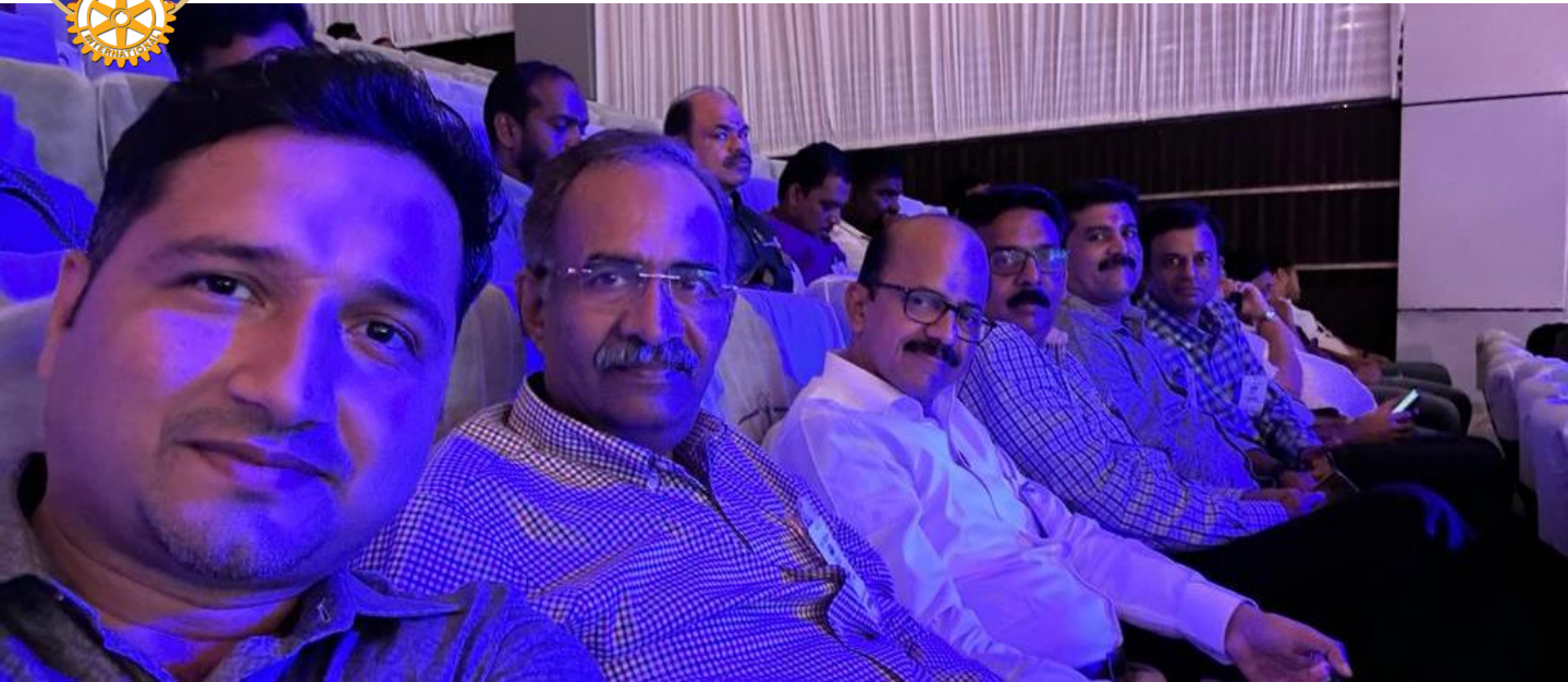
20231029-Six Rotarians from our club attended the Leadership and Public Image District Seminar at Gokulam Park Kochi on (Above and below)