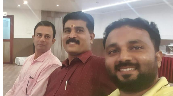
5-9-2023 GOV RC Pattambi