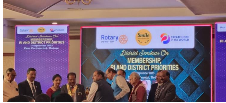
17-9-2023 District Membership Seminar