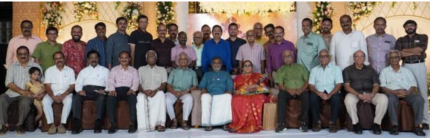
Rotarians, Anns and Annets attended the function on 15-Oct-2023 at the Gazebo Heritage, Shoranur.