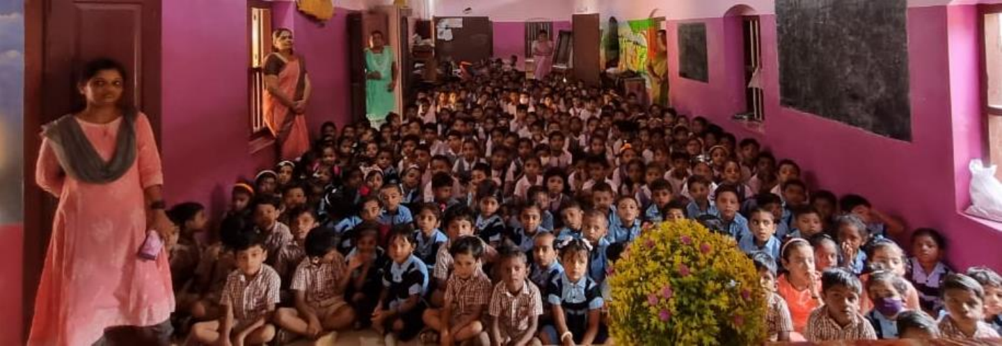
21-9-2023 play equipment donated to Vanivilasini school