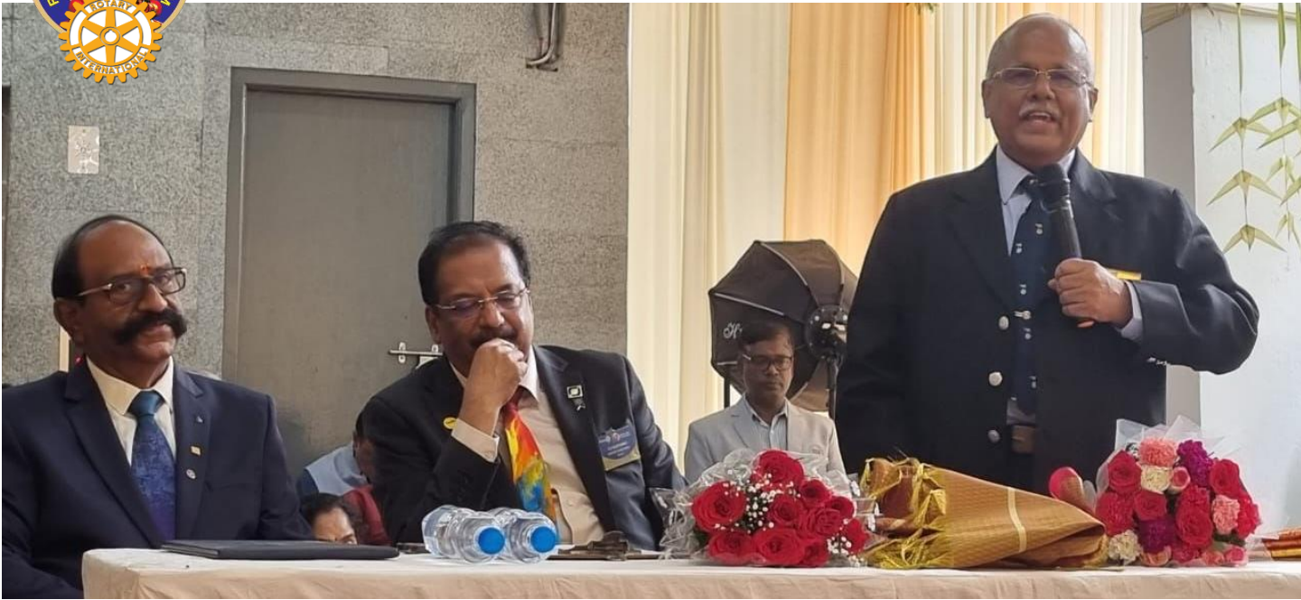
Attended the opening ceremony of District Secretariate 2024-25 on 25-10-2023 at Coimbatore