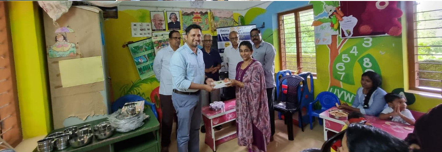
15-9-2023 Steel utensils and books donated to Anaganawadi at Vayyatukulam