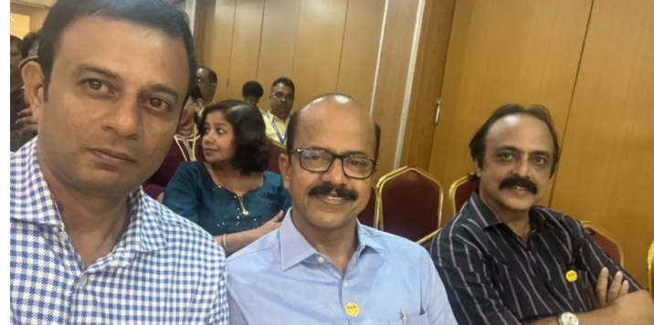
2-9-2023 GOV RC Shoranur