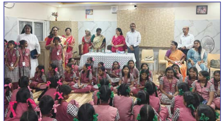
Dr K K Nirmala Girls HS School