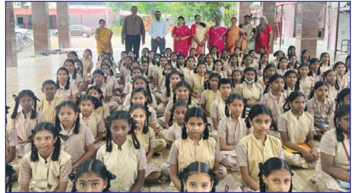
Chennai Girls HS School, Saidapet