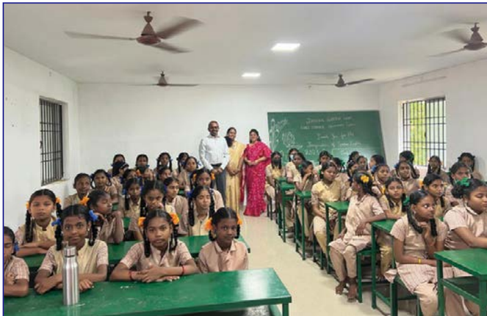
Jaigopal Garodia Govt Girls HS School